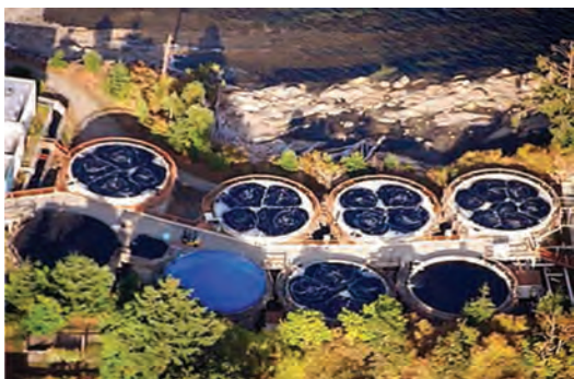
Sea Farm, Vancouver, BC

"The Future of nutrition is found in the ocean."